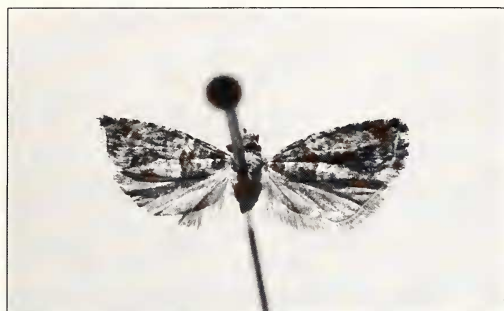
Figs. 1. Notocelia punicana from Iran

Male genitalia (Fig. 3). Tegumen rather short, broad; socius very large, expanding beyond naked base, especially beyond it internally; remnants of gnathos as slender, fairly long sclerites; valva long with weak ventral depression and rather broad neck; cucullus long, somewhat protruding ventro-proximally; aedeagus slender, with both deciduous and non-deciduous cornuti; the fixed cornuti with a pair of posterior spines, the deciduous cornuti are situated rather in middle of vesica.